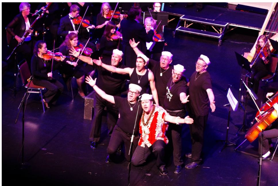
Members of the PMAZ Chorale and special guest artists perform a number as the sailors in South Pacific.